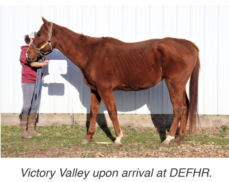
Victory Valley upon arrival at DEFHR.