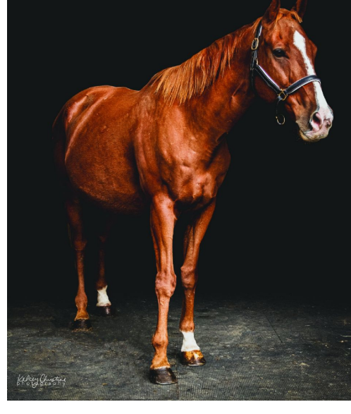
Victory Valley after rehabilitation.

Victory Valley, a 13-year-old Warmblood gelding, came to DEFHR just under a year ago as a neglect case from Carroll County, Maryland. He was underweight and suffering from overgrown feet with ill-fitting shoes, causing lameness and discomfort. "Valley" has since made a full recovery and an incredible transformation, and is now available for adoption.