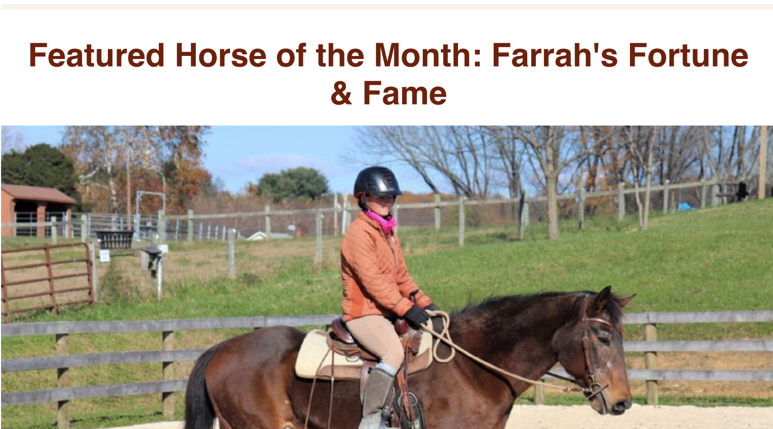
28-year-old Quarter Horse mare, 15hh

Farrah's Fortune & Fame is an older mare, but you would never know it when you meet her. Even at 28, "Farrah" has made it clear to us that she enjoys having a job and would love to continue doing light trails or pleasure riding. Farrah has a kind, quiet presence and would make a great addition to any barn.